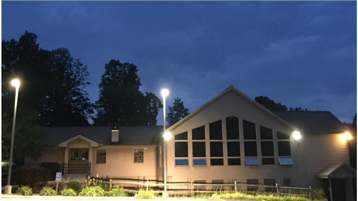
PARKING LOT LIGHT, WEEDING & RAMP REPAIR