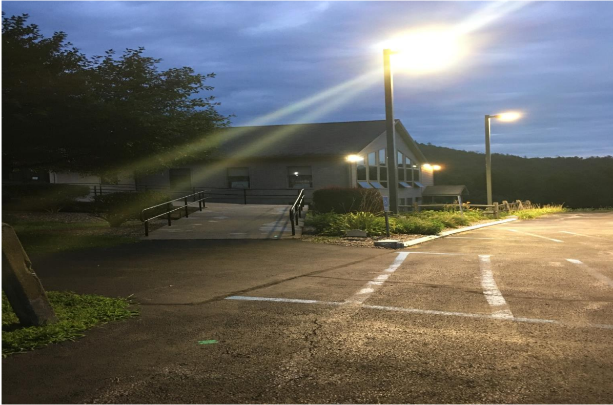
OUTSIDE LIGHTS WALKWAY AND RAMP